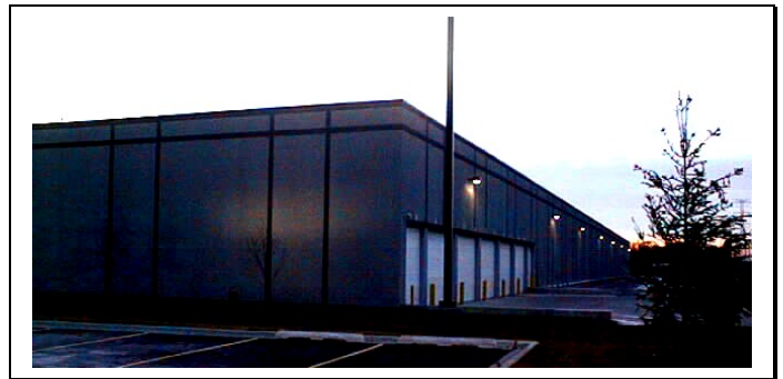
Southeast Corner View