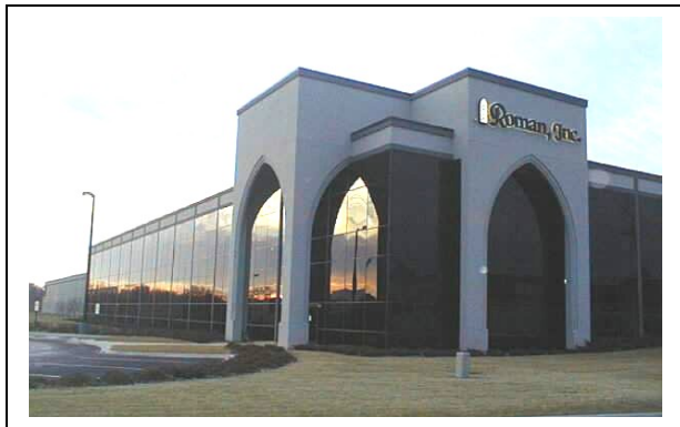
Southwest Corner View