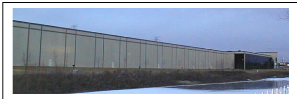
West Side View